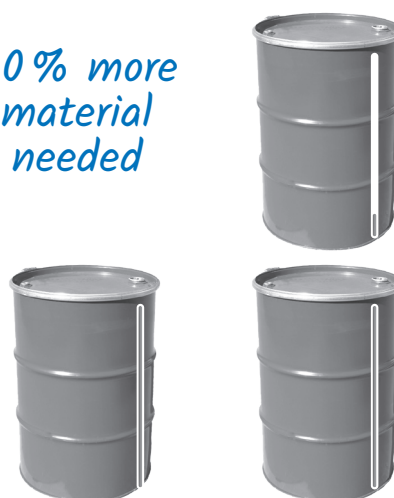
Kromasil 100-10-C8 = 10.62 kg