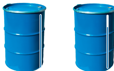
YMC-Triart Prep Bio200 C8 = 8.85 kg