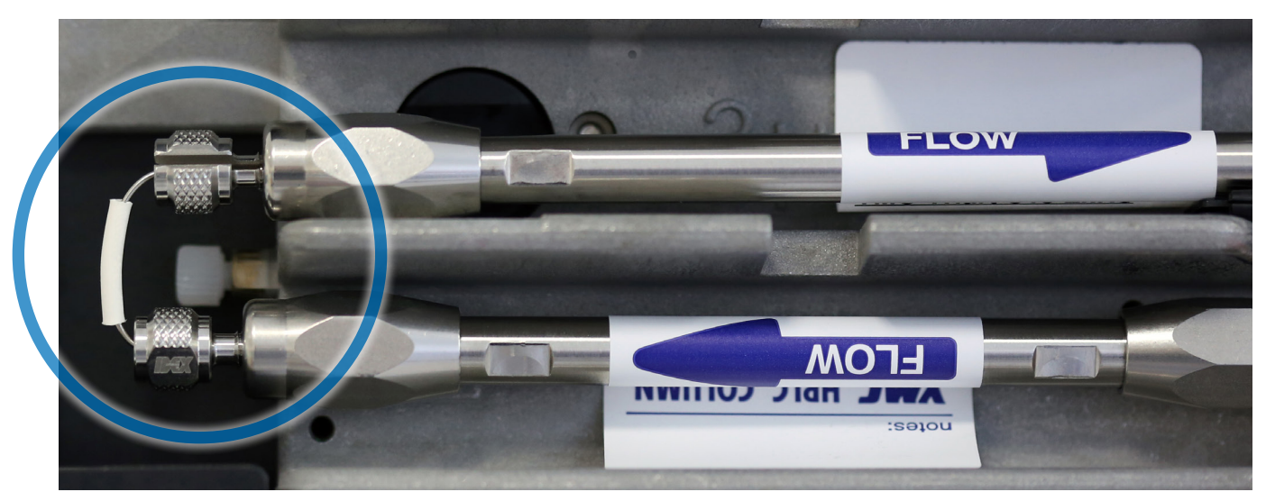
Figure 1: Coupling of two YMC-Triart C18 ExRS UHPLC columns using the dead volume free MarvelX™ connector.